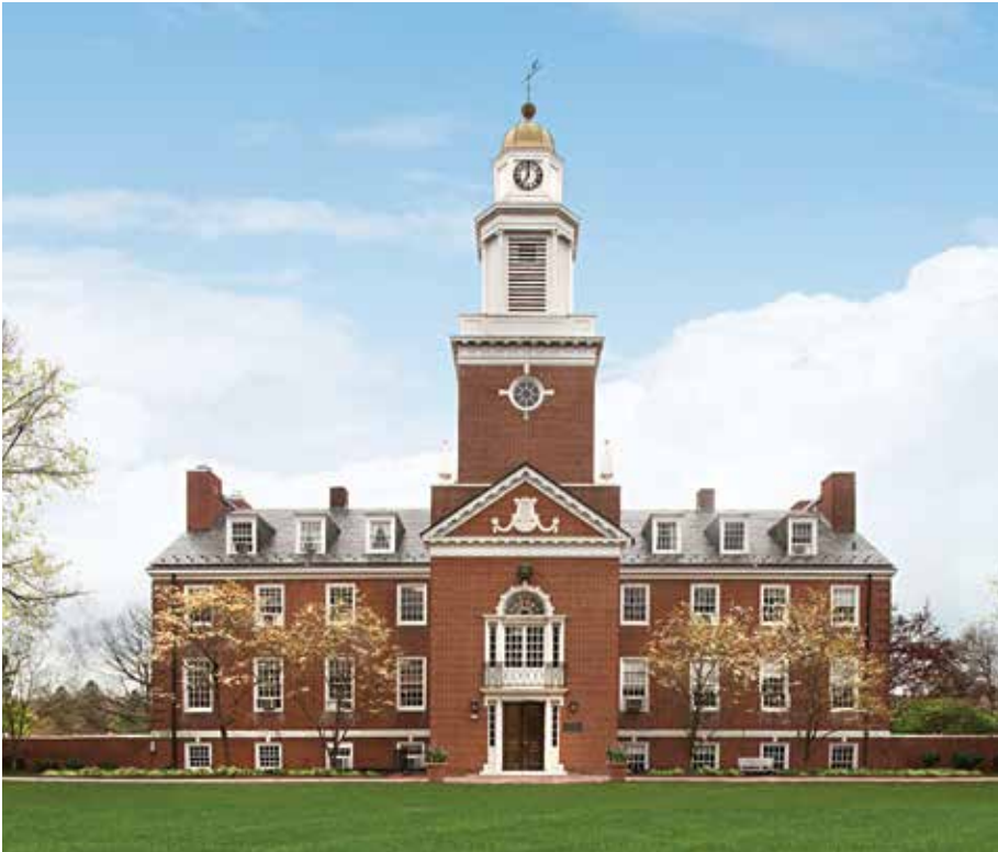
Westminster Choir College of Rider University

Westminster Choir College is one of the world's leading schools of choral music. Located in Princeton, NJ, Westminster prepares students for careers in performance, education, church music, and professional and community organizations.