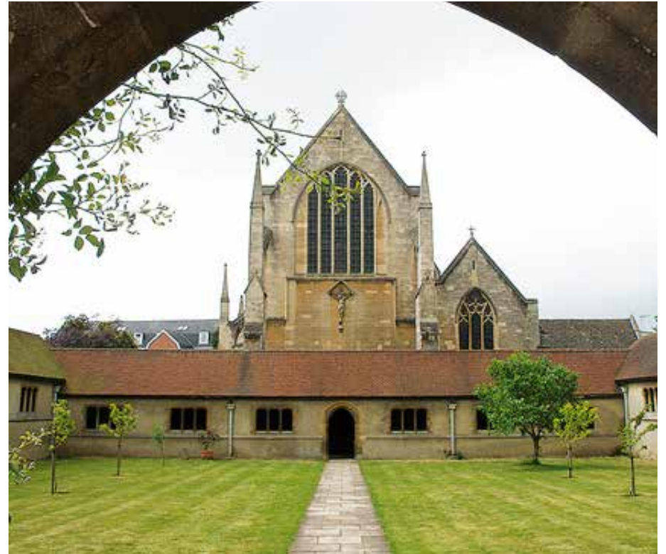
St Stephen's House, a Hall of Oxford University

Westminster Choir College is one of the world's leading schools of choral music. Located in Princeton, NJ, Westminster prepares students for careers in performance, education, church music, and professional and community organizations.