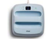
Cricut EasyPress 3