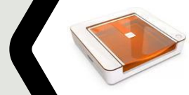
Glowforge Aura Laser Cutter