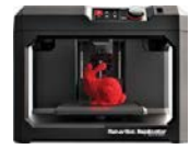
MakerBot 3D Printers