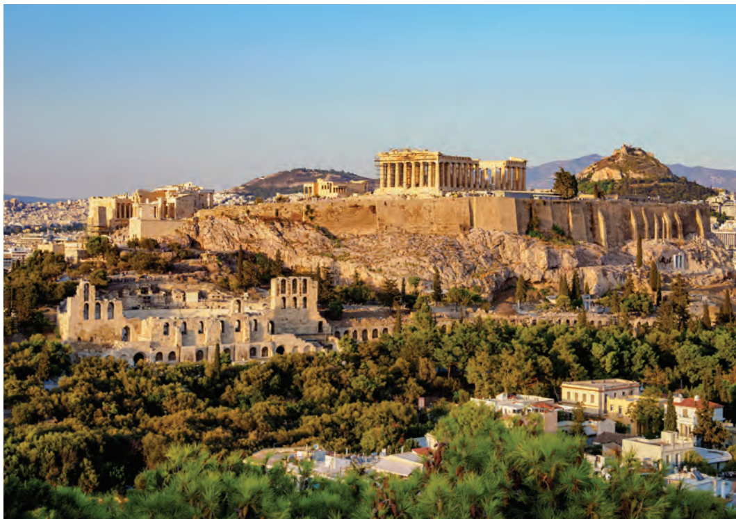
On Day 3 we visit the Acropolis in Athens.

Day 6: Mycenae/Epidaurus It's a day steeped in ancient history as we first tour the imposing ruins at Mycenae, a UNESCO site that represented the pinnacle of civilization from the 15 th to the 12 th centuries BCE. A key influence on the development of classic Greek culture (and hence Western civilization), Mycenae also is linked to Homer's epics, Iliad and The Odyssey . We see the Tomb of Agamemnon, with what was the world's highest and widest dome for more than a thousand years, and the Lion's Gate, the only known Bronze Age monumental sculpture in Greece. We move on the vast archaeological site and museum of Epidaurus, with its 2,300-year-old theater – a master-piece of Greek architecture known for its perfect acoustics – still in use today. Long associated with healing and medicine, Epidaurus comprises one of the most complete sanctuaries remaining from antiquity. Then we return to Nafplion, where the afternoon is free for lunch on our own and perhaps to explore this gem of a Venetian/Byzantine town with picturesque narrow streets, fortifications, and a bounty of waterfront cafés. Tonight, we enjoy dinner together at a local taverna. B,D