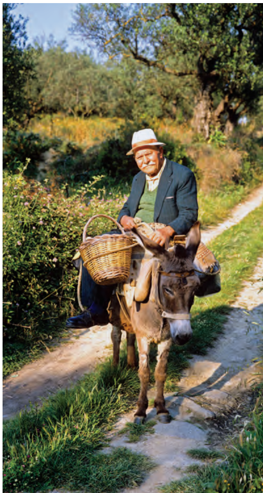
Old ways endure ...

Day 14: Depart for U.S. We transfer to Athens’ international airport this morning, where we connect with our return flight home. B