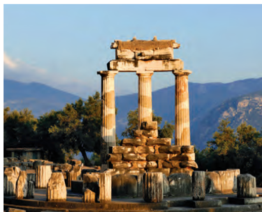
On Day 4, we tour the ruins of Delphi.