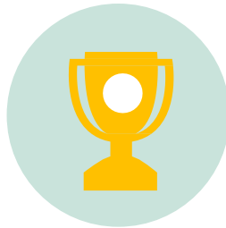
50+ Soft Skills Courses