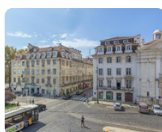
Corpo Santo Lisbon Historical Hotel Rua do Corpo Santo 25, Lisboa, Lisboa, PT, 1100