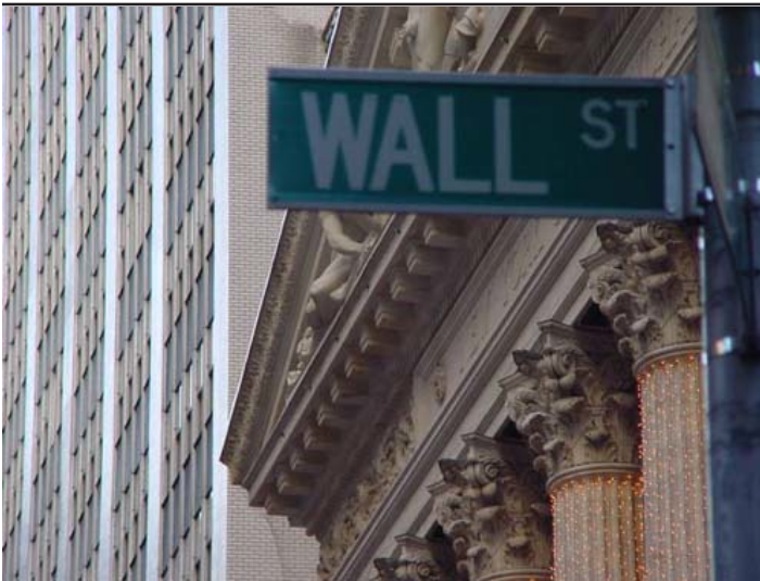
Site of former Rider student's internship on Wall Street in New York City.