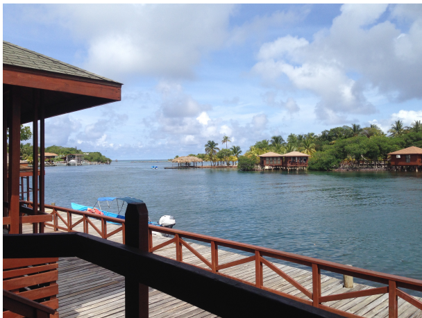
View to Anthony's Key Resort from RIMS.

RIMS is a renowned research and teaching institution dedicated to the study of tropical marine ecosystems including behavioral research and training of Atlantic bottlenose dolphins housed at the facility. Students receive four academic credits, learn about the ecology of Caribbean coral reefs, and develop a deeper understanding of how physical factors influence biology in various ecosystems.