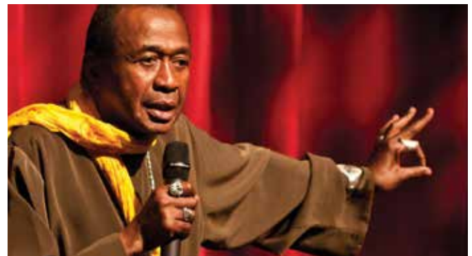
Famed showman Ben Vereen spoke to students, faculty and staff on the Lawrenceville campus.